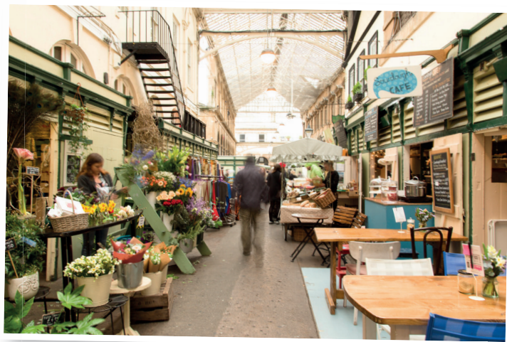
ST NICHOLAS MARKET

Get your heart pumping by walking up trendy Park Street, the student mecca of Bristol. Rest up briefly at Boston Tea Party Café and indulge in one of their sweet or savoury scones after midday (when they come out of the oven) – you can thank us later. Pick up stocking fillers including artisan chocolates and homewares from the Guild Gallery. They also stock unique cards and posters. While you're in the area, why not treat yourself to a new outfit for that upcoming Christmas party from one of the independent stores? If you're after gifts to pamper, pop in to The Body Shop – their Hemp Rescue Balm is a one-stop-shop to smoother skin. L'Occitane en Provence also has lots of gift sets to inspire.